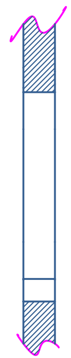
SECTION A - A