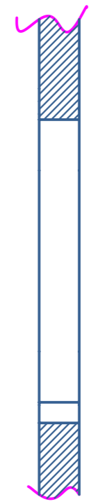
SECTION A - A