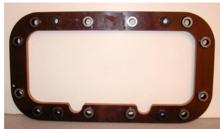
Template/drill guide all sizes popo