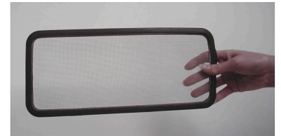
Stainless Screen installs from the inside