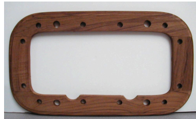
Teak Spacer is solid 5/8"