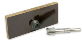
Drill Guide and Counter Bore