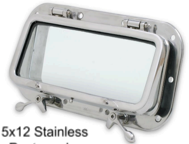
5x12 Stainless Rectangular

5x15 Elliptical 5x12 Oval & More See Website for Pictures & More Info!