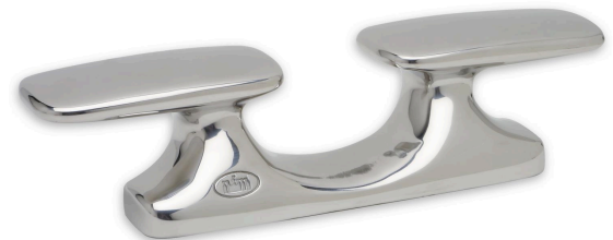
Cleats, Cleat Chocks and other hardware are high polish