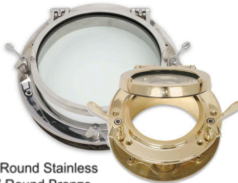
12" Round Stainless & 5" Round Bronze

Portlight Features Bolt-through construction Fully adjustable hinges & dogs Spring & Friction Hinges 8 and 10mm tempered glass EPDM gaskets Built in drains